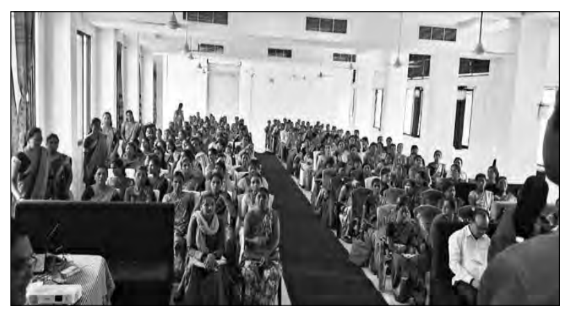
Women trainees present in Gadchiroli district for "Goods Agricultural Practices" training programme for chilli under MAGNET.

Training conducted at Manchar, Tehsil- Ambegaon , District-Pune regarding various schemes of the Government for empowerment of PACS.